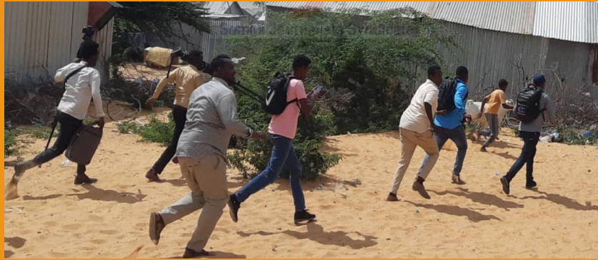
Journalists run for shelter after police attacked a group of journalists at Zone-K in Hodan District, Mogadishu on 17 December, 2020.

On 17 December 2020 , armed Somali police attacked a group of journalist from local media and international news agencies at Zone-K in Hodan District, Mogadishu, as they were planning to cover an opposition demonstration that day 211 . Armed police dispersed the demonstrators (mainly young men and women) and chased 212 the journalists.